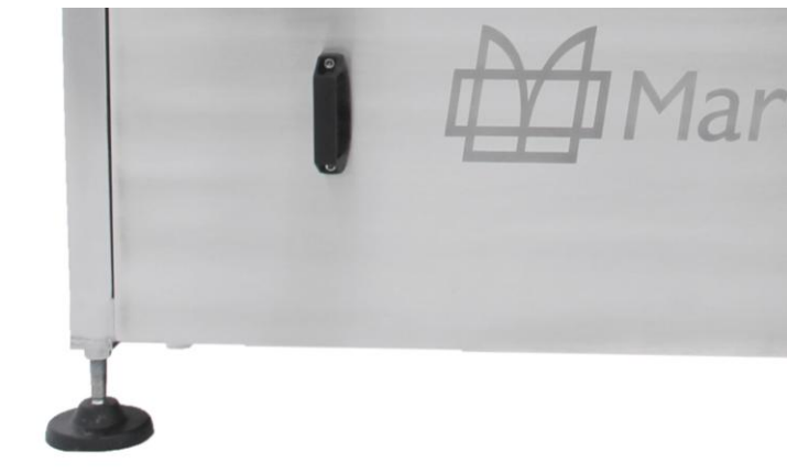
6 Pack Tub Filler