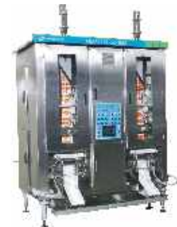
Filpack Servo SMD