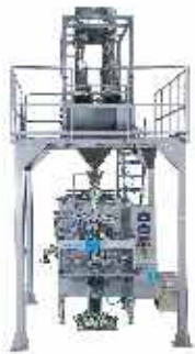
Excel Plus Series

Nichrome offers a complete range of packaging machines for solid, liquid and viscous, food or non-food. Nichrome machines are efficient, accurate, reliable and operator friendly. All our machines are customized as per the need to suit the product as well as the market.