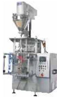
Sprint 250 Plus Series