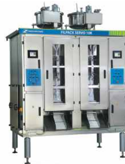
Filpack Servo 10K